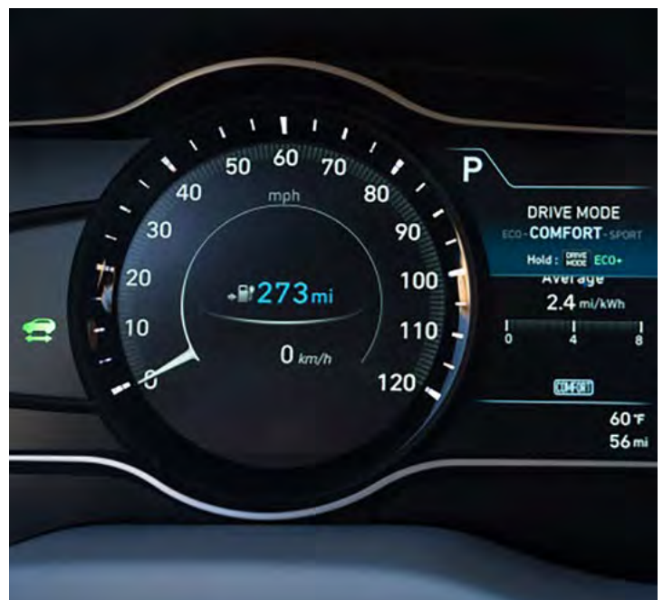
Photo Right: Hyundai MOBIS adopts GL Studio, to develop the Kona Electric Vehicle instrument cluster.